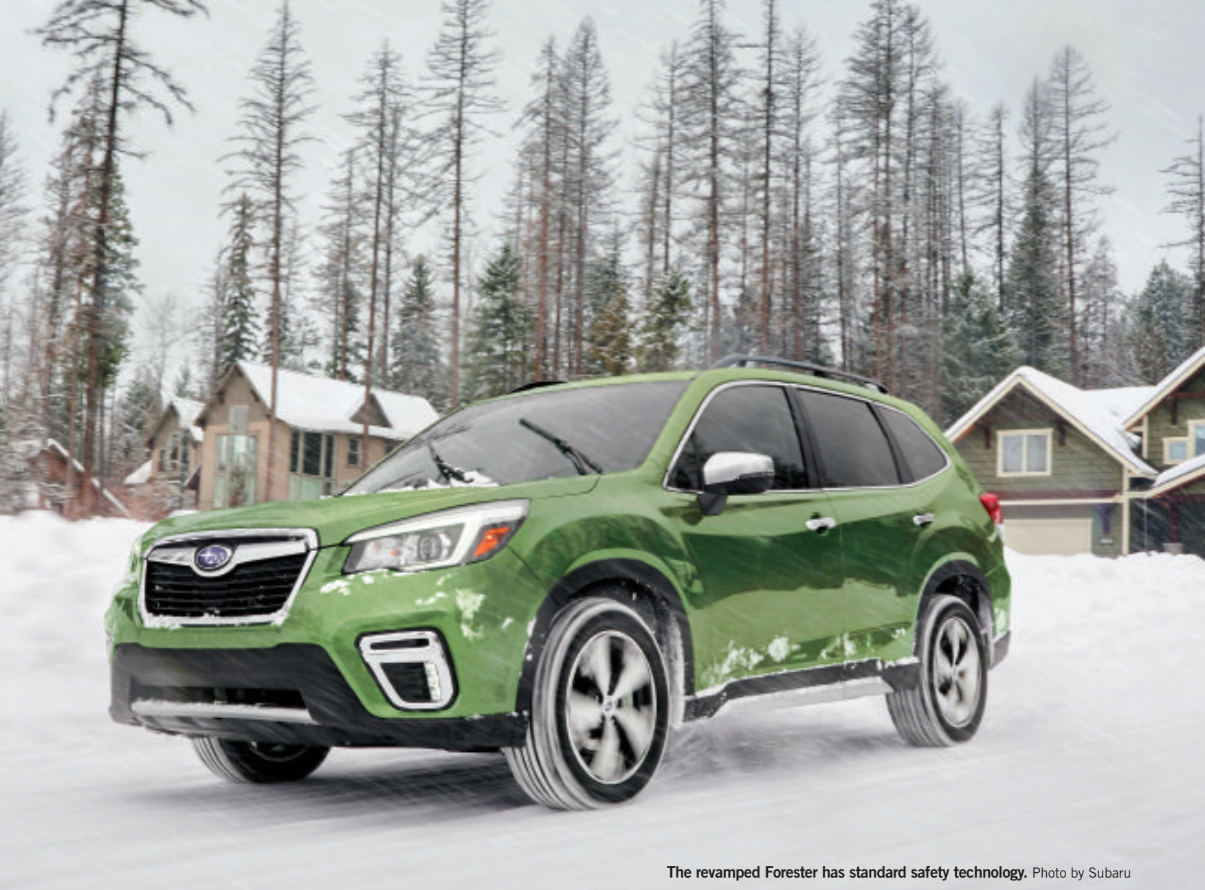
The revamped Forester has standard safety technology.