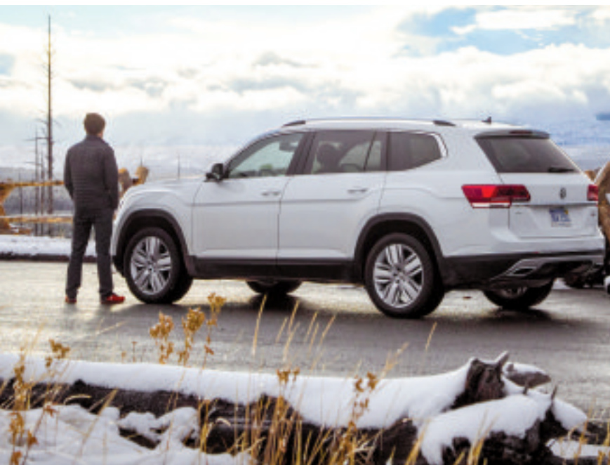
VW's Atlas adds European flair to winter driving.