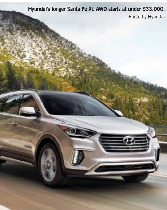
Hyundai's longer Santa Fe XL AWD starts at under $33,000.