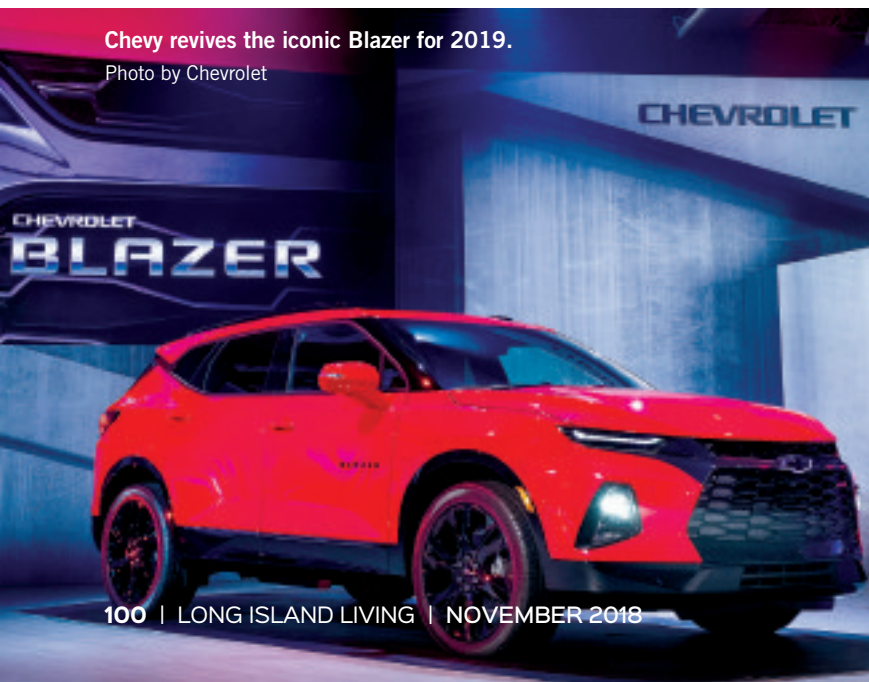
Chevy revives the iconic Blazer for 2019.