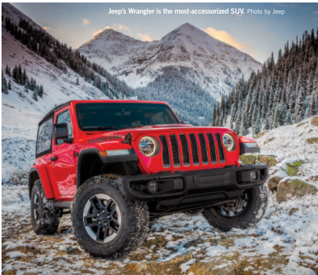
Jeep's Wrangler is the most-accessorized SUV.