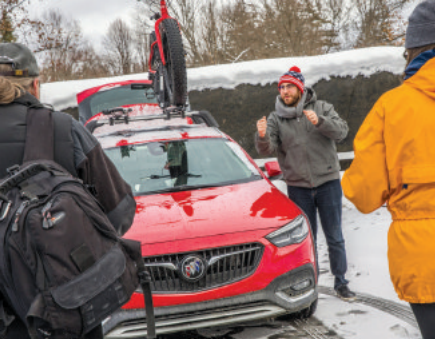
The Buick Regal TourX wagon makes the cut for winter sports.